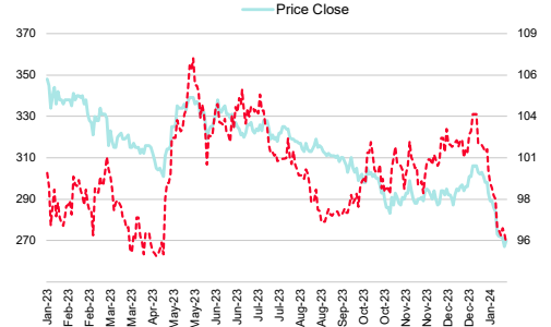
Siam Cement (SCC TB)